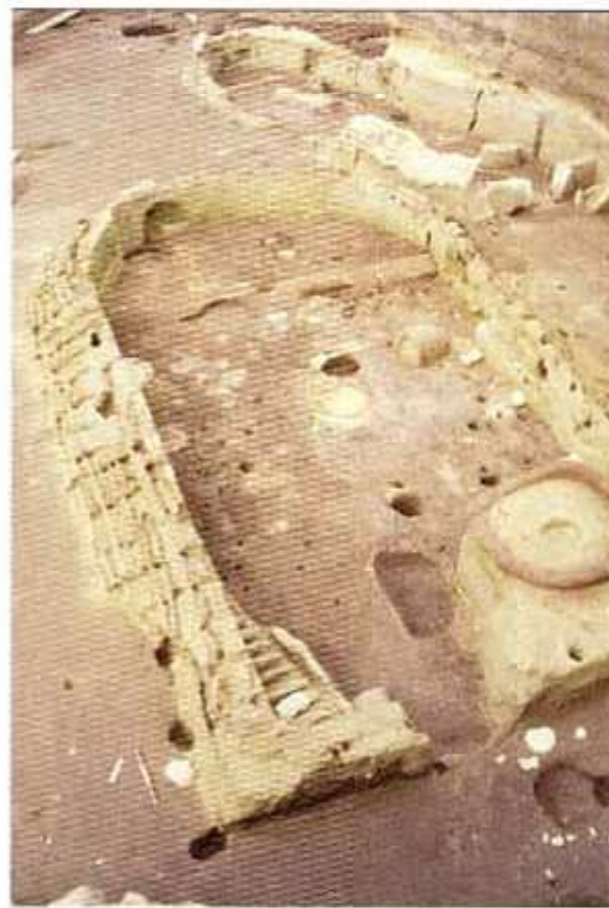
FIGURE 4. General view of Huts 3 and 4 under excavation.

The first archaeobotanical analyses have produced carbonized macro-remains and impressions in the ash of cereals ( monococcum , dicoccum and barley), fruit, nuts (almond Amygdalus communis ) and other vegetable matter (olive stone and acorns). Numerous remains of carbonized woods belong to beech, black hornbeam and fig; these give the impression of a human landscape with fruit trees, pasture and cultivated fields not far from a mixed beech woodland.