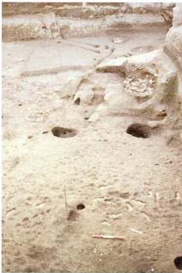
FIGURE 2. In the foreground, prints left by men and bovines; in the background, an animal pen with pregnant goats.