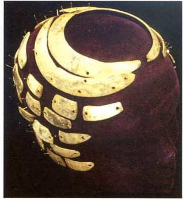
FIGURE 3. Reconstruction of the pig's tusk head-dress.